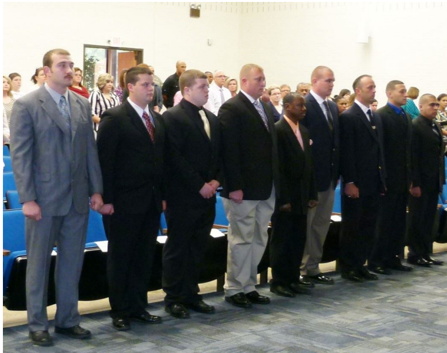
BLET 2014 Graduation