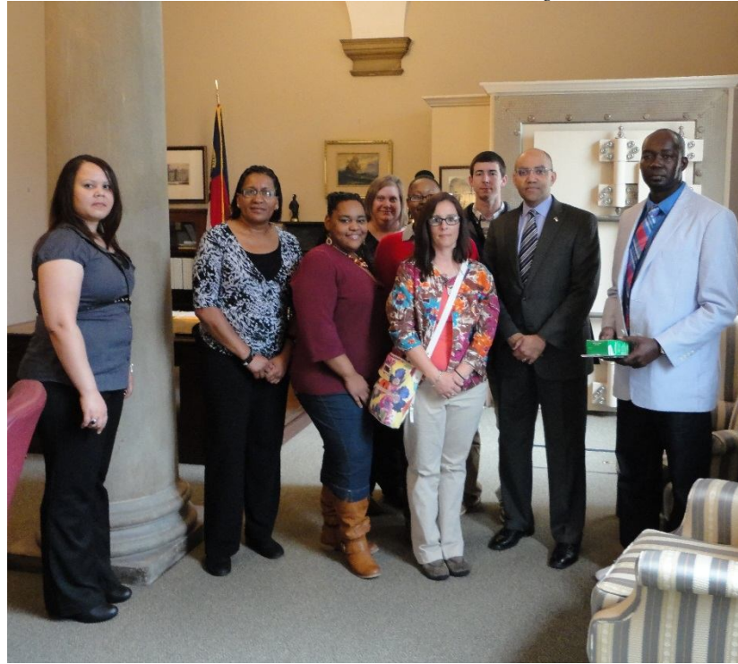
Student Government Association in Raleigh

Permanent record files are scanned and stored electronically through Singularity, a Hyland Software product. Student information is stored on a local server that is copied daily to prevent any loss of information. Both active and inactive records are accessible through the intranet-based application. The records are archived by name, student id #, social security number, and birth date. Bladen Community College does not rely on paper to store permanent records; therefore, the records are protected against fire, theft, destruction, and other hazards.