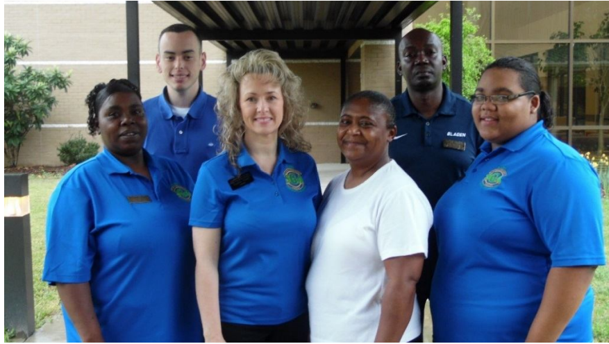
Members of the SGA