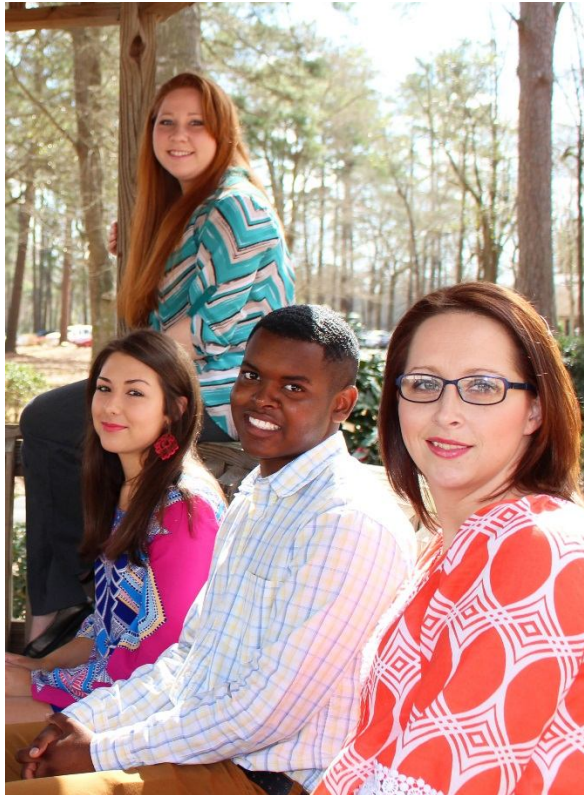
Students at the Gazebo