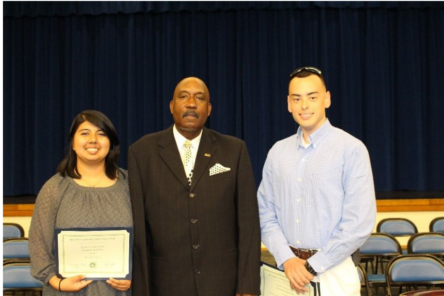
Spring 2017 Academic Awards Ceremony