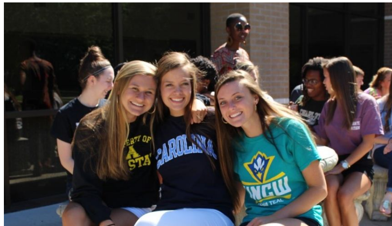
Associated degree students transfer to four-year universities as juniors

The Customized Training Program supports the economic development efforts of North Carolina by providing education and training opportunities for eligible businesses and industries. Customized Training offers programs and training services to assist new and existing business and industry to remain productive and profitable. The purpose of the Customized Training Program is to provide customized training assistance in support of full-time production and direct customer service positions created in the state of North Carolina, thereby enhancing the growth potential of companies located in the state while simultaneously preparing North Carolina's workforce with the skills essential to successful employment in emerging industries.