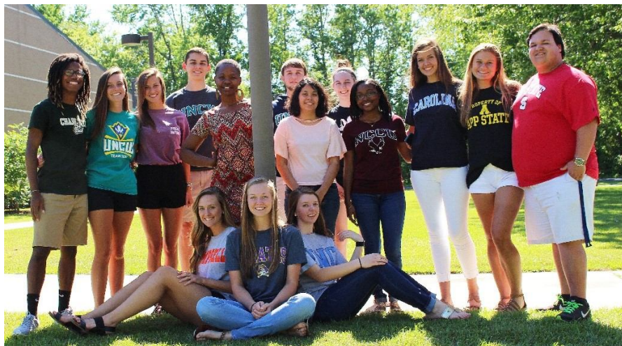
Career and College Promise Program Students

Beginning Fall 2013, senior citizens will be responsible for paying full tuition.