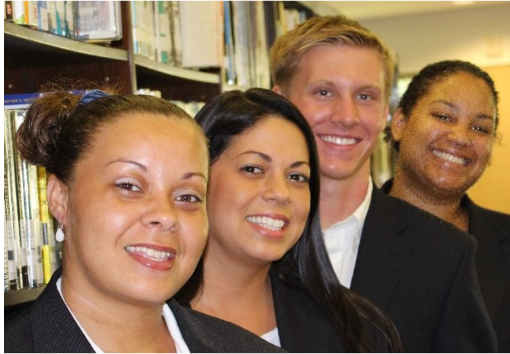
BCC Ambassadors 2016-2017