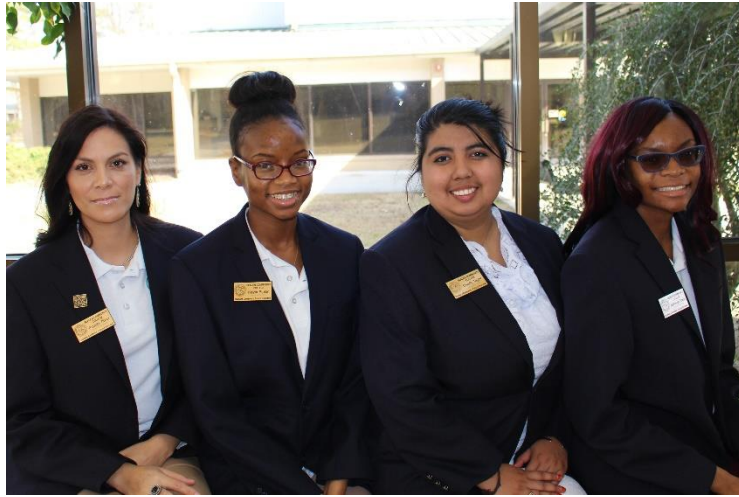
BCC Ambassadors 2017-2018