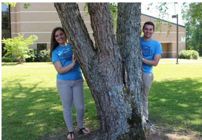
Career and College Promise Students

Students interested in participating in one of the Career and Technical Education Pathways must meet the following criteria: (1) be a high school junior or senior; (2) have a weighted high school grade point average of 3.0 or higher or have the recommendation to participate from the high school principal or his/her designee, and (3) meet the prerequisites for courses in the pathway. A Career and College Promise Enrollment Form must be completed and signed by the appropriate school officials.